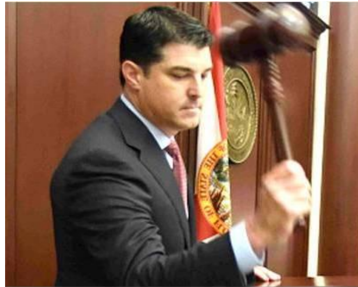
The Speaker Tuesday, April 28, 2015

Tuesday, April 28: 1:46 pm – email received “House just adjourned sine die ”